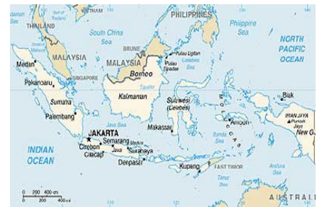
Above: A map of Indonesia, taken from www.oxfam.org.au

Information taken from the Jakarta Post at http://www.thejakartapost.com/detailheadlines.asp?fileid=20050930.A07&irc=6